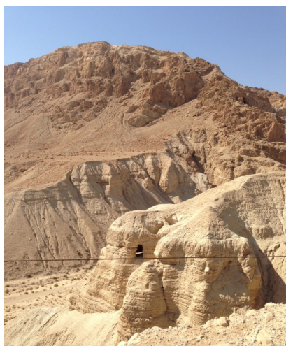
Qumran, featuring cave number 3 in the foreground.

The Dead Sea Scrolls, in the narrow sense of Qumran Caves Scrolls are a collection of some 981 different texts discovered between 1946 and 1956 in eleven caves from the immediate vicinity of the ancient settlement at Khirbet Qumran in the West Bank. The caves are located near the northwest shore of the Dead Sea, from which they derive their name.